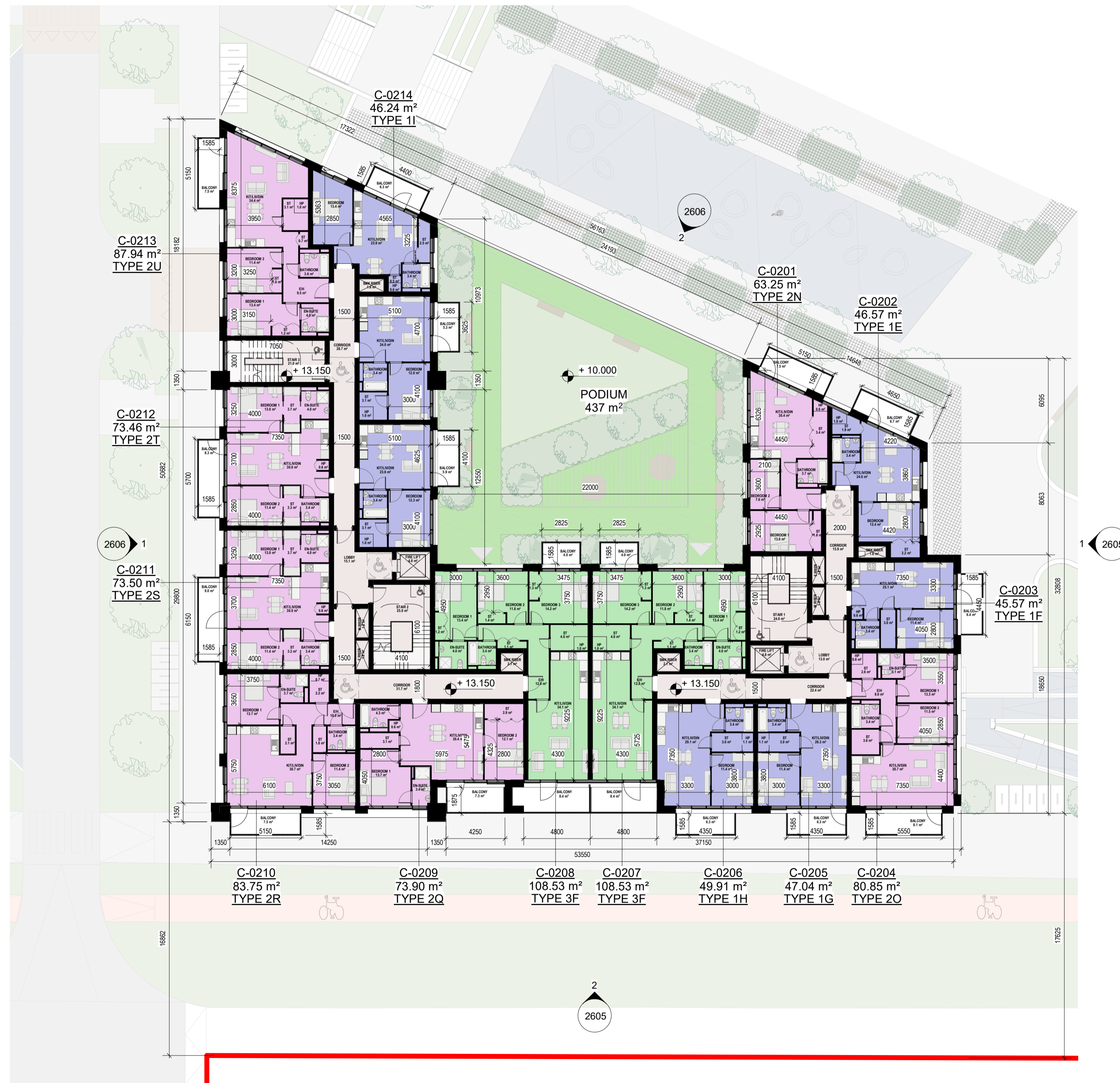
Accommodation Schedule-BLOCK C_L02